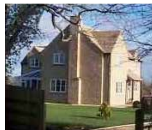
Wheatleys Farm High Road, Ashton Keynes, Swindon SN6 6NX T: 01285 861310

FOR MORE INFO VISIT: www.english-inns.co.uk