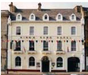
Kings Head Hotel 24 Market Place Cirencester GL7 2NR T 01285 700 900

FOR MORE INFO VISIT: www.cotswoldwaterparkhotel.co.uk/