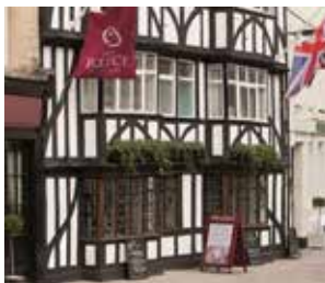
The Fleece Hotel Market Place, Cirencester GL7 2NZ T: 01285 658507

FOR MORE INFO VISIT: www.wheatleysfarm.co.uk