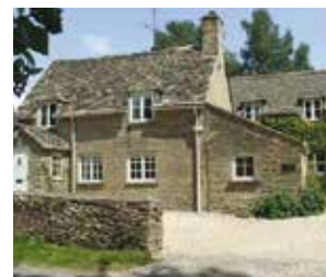
Well Cottage B & B Ewen, Cirencester, Gloucestershire GL7 6BU T: 01285 770212

FOR MORE INFO VISIT: www.kingshead-hotel.co.uk